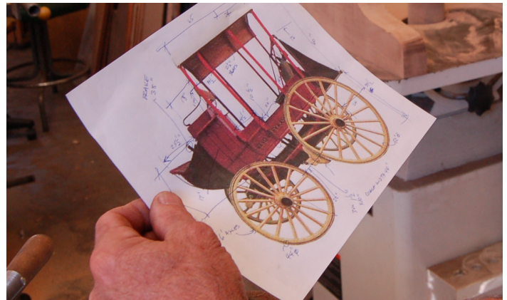
An image of the Tucson Rodeo Parade Museum's mud wagon with exact dimensions for constructing a replica coach.

Reconstructing the old wagon frame has been quite a job. First, we