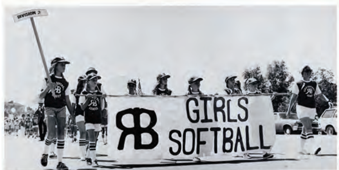
The Rancho Bernardo's Girls Softball Team, dressed in full uniform, walked away with first prize in the Girls' Youth Group category.