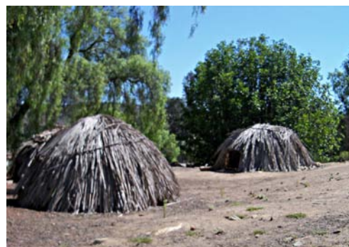
Traditional Kumeyaay Huts or "Ewaas"

I hope you will come along with us on this journey of discovery as it unfolds.