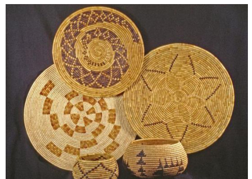
Native American Basketry