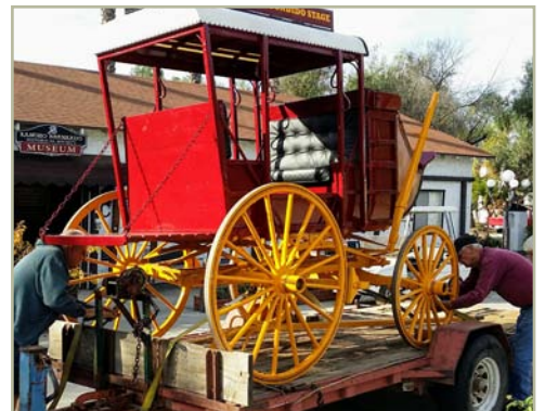
Loaded on trailer for transport to event