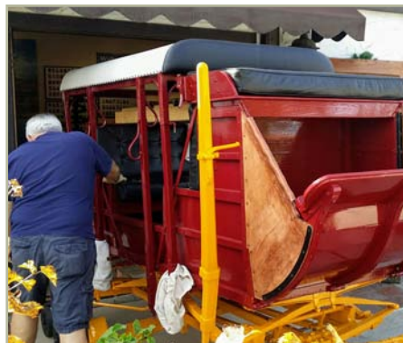
Canopy lowered ready for reassembly