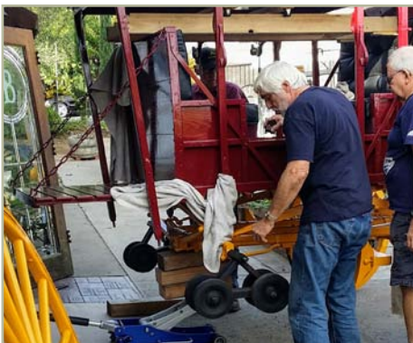
Wheels removed being moved outside