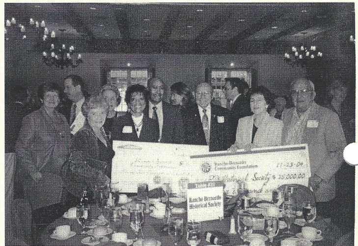
Members attending the Thanksgiving Luncheon at the Rancho Bernardo Inn have a firm grip on the grants checks