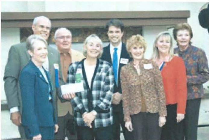
Grant recipients and donors during the Annual Thanksgiving Luncheon held at the Rancho Bernardo Inn and hosted by the Rancho Bernardo Community Foundation

selling 300 paving stones at $250 each, to enable us to break ground. Isn't that exciting? Dollar by dollar, event by event, donation by donation we have been the little engine that could, remember? 'I think I can, I think I can, I think I have a plan, and I can do most anything if I just think I can.' And you can help. Through the purchase of a 'paver' that will grace the walkway and the gardens to the beautiful new museum, you can commemorate yourself, your family or group, or other friends down through time. That's what the museum is all about: preserving history's past, present, and future. For more information about this program, please visit our expanded online store at http://rbhistoricalsociety.org/ Thank you!