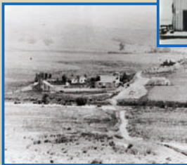
Town of Bernardo