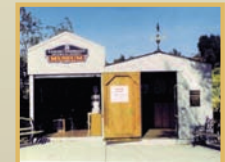
First RB History Museum