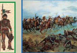
Battle of San Pasqual