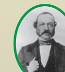
Captain Andres Pico