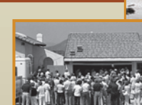
Mirador Sales Office